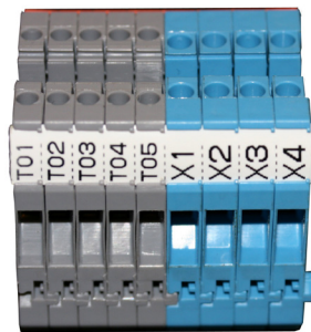
PP+ profile mounted on blocks