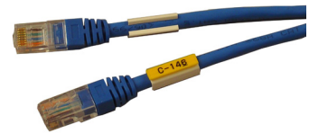
PP+ profile in PTC sleeve