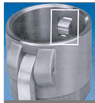
Detent position of Twin-Kam™ arms help prevent unintentional arm release.