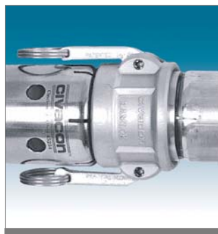
Spring-Ring™ Finger Rings prevent rings from getting trapped under arms.