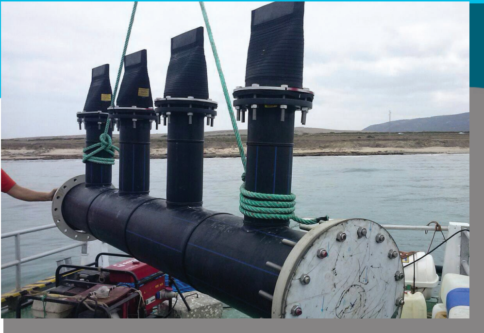
Detail of the ProFlex™ Flanged Rubber Check Valve; Style 710

Available Elastomers Neoprene (Barnacle and Algae Resistant), ANSI/NSF-61, EPDM, Nitrile, Natural Rubber, CSM and Chlorobutyl.