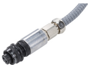
SHIELDED CABLE 2X1 WITH METAL JACKET COVERED BY PVC 95743-P CBL/TR-26 / A / 0 / XX (length in meters)