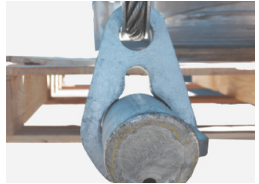
Easy Hook Up Secure locks hold in place