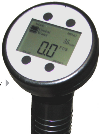
Digital Display ▶