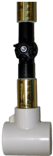
◀ Optional Swivel Tee